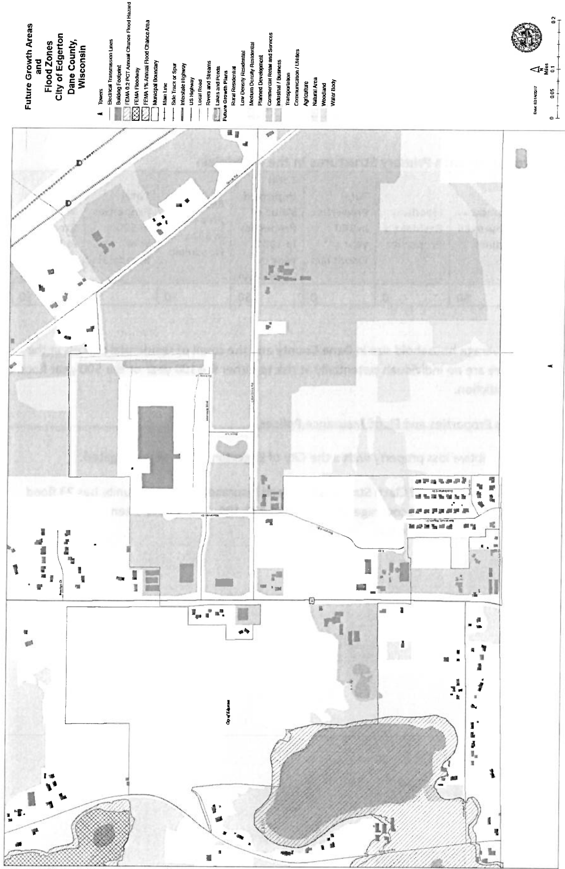
Figure 1 Flood Hazards and Future Land Use Map